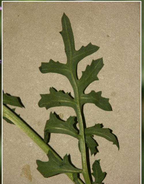
Amberboa moschata (halbruderal bei Erebuni/Jerevan)