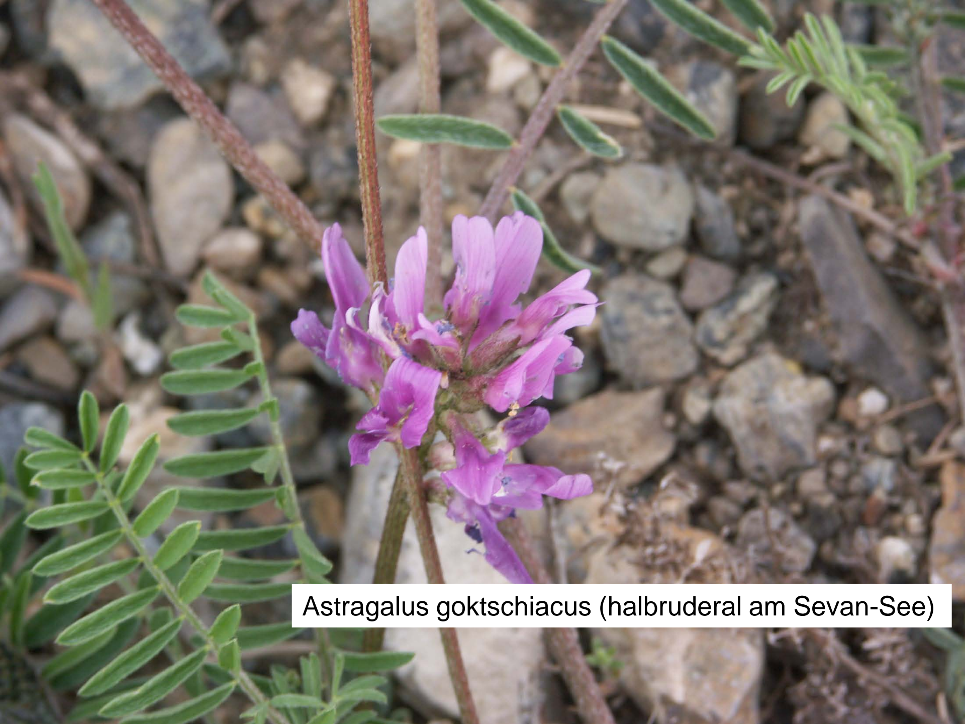
Astragalus goktschiacus (halbruderal am Sevan-See)