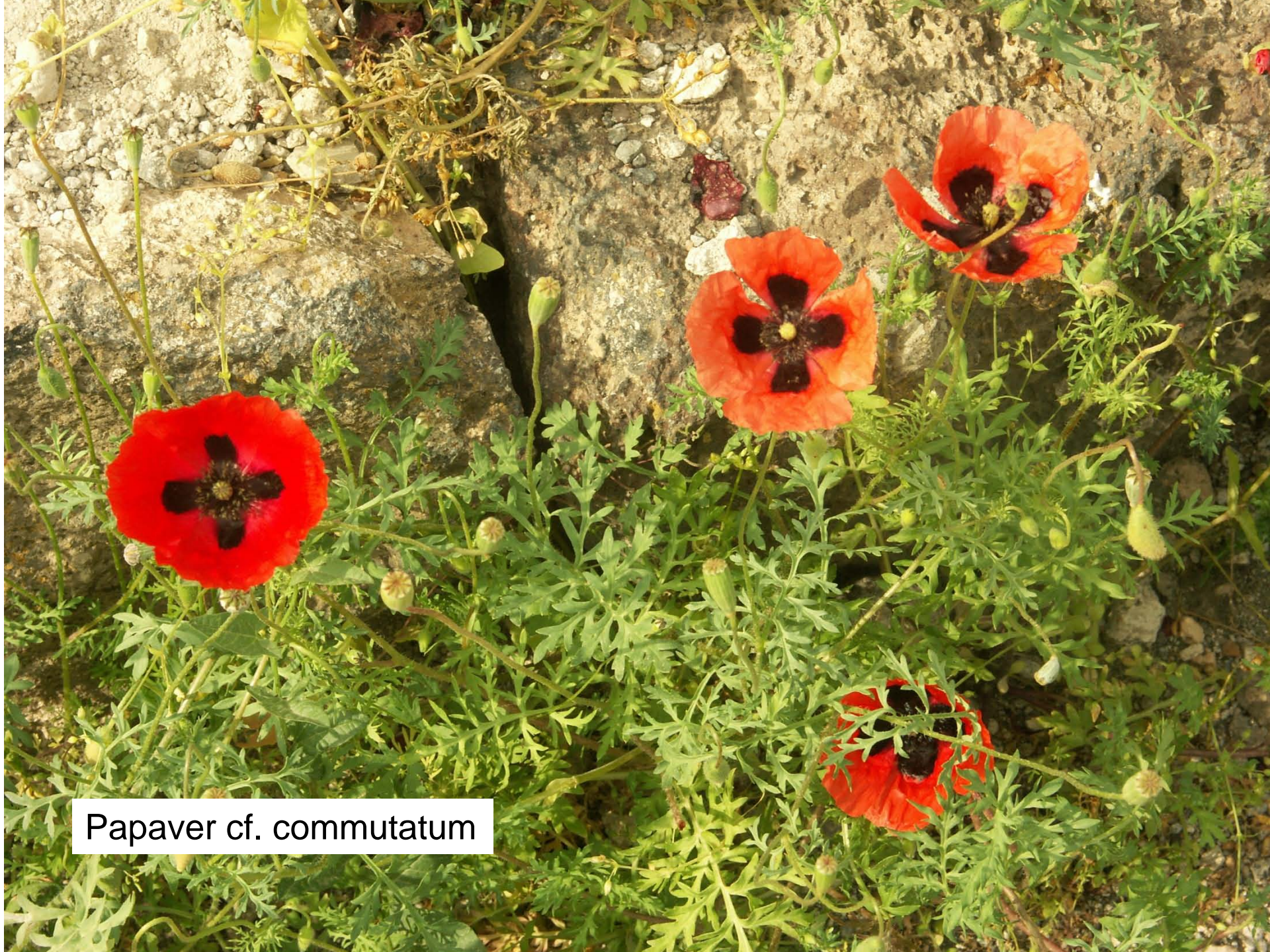
Papaver cf. commutatum