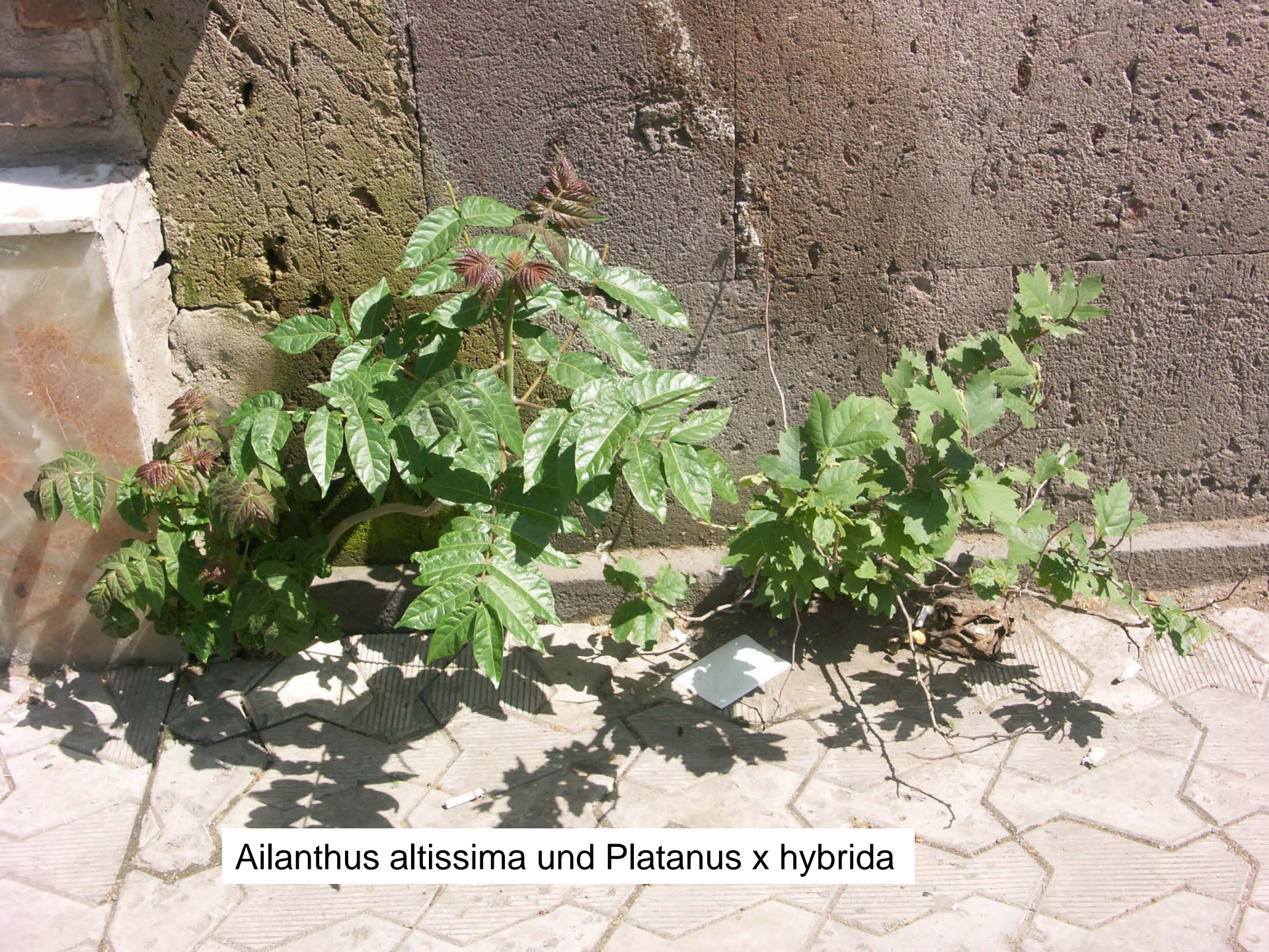
Ailanthus altissima und Platanus x hybrida